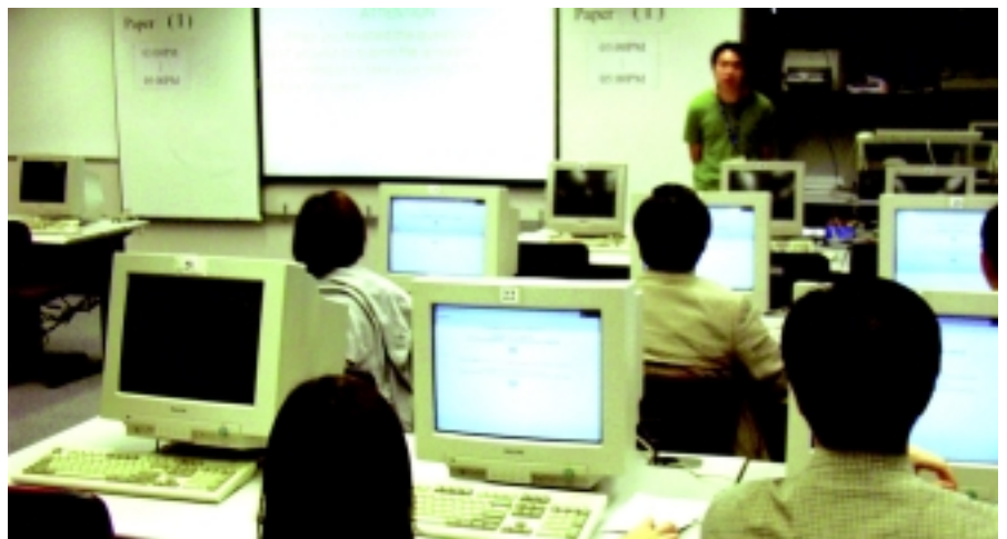
保險中介人資格考試電腦應考模式 Computer Screen Mode Examination for the IIQE

The examination fee of the Computer Screen Mode Examination ("CSME") for the IIQE has been revised since 1 September 2003. The fee for any one examination paper in respect of the four insurance examinations for the CSME is now HK$150 each.