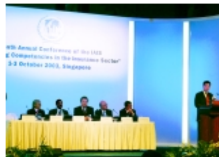
國際保險監督聯會第十屆周年會議 The 10th Annual Conference of the International Association of Insurance Supervisors

of Mutual Assistance and Exchange of Information ("MoU") with the Financial Services Authority of the United Kingdom on 9 October 2003. The MoU seeks to provide a framework for cooperation, including channels for communication, mutual understanding, exchange of information and investigative assistance between the two regulators.